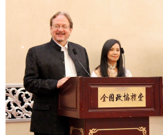
November 20th, 2013, National People's Congress Hall, Beijing, China