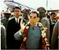
Bandung Conference to announce the Five Principle of Peace